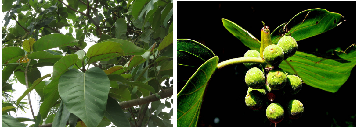
Fig. 1 : Ficus Dalhousiae Plant twigs and fruits

bark, root, root-bark, flowers, fruits and seeds are well known to have medicinal properties and have a long history of use by indigenous communities in India. The medicinal value of this plant is mainly for the treatment of a large number of human ailments. The leaves and the stem bark of the plant are used in liver and skin diseases. Bark paste is used in the treatment of leprosy. Fruits are used as cardio tonic (Khare 2004; Flora of Presidency of Madras, 1957)